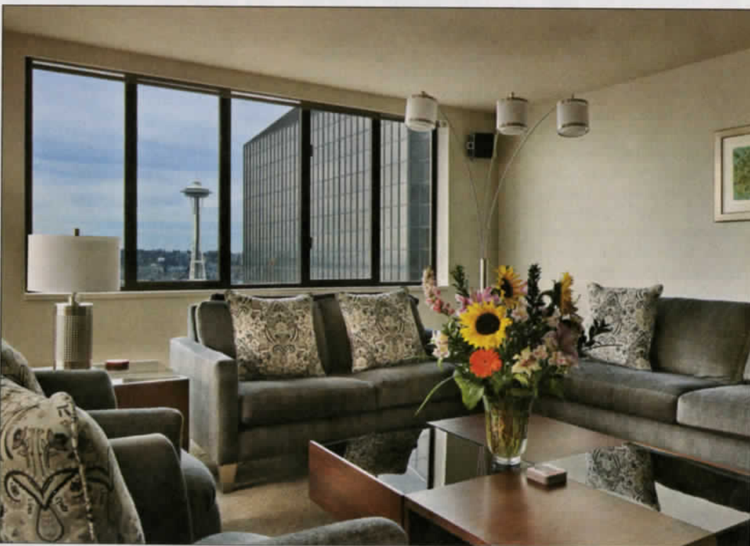
Condo owner Dawn Trudeau bought the living-room furniture at Modern Design Sofa in Seattle. "There's a lot of space, but at the same time it's a cozy little spot," she says. "I was sitting here a couple of months ago, and I watched the fog come down and cover up the Needle. It was like a curtain," she says. "That does not get old."