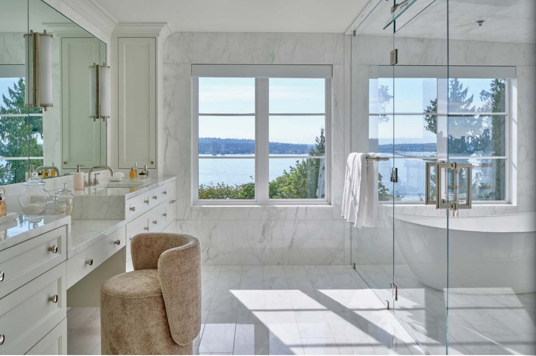
The completely redesigned primary bath glows with exquisite slabs of flow-matched Calacatta Caldia marble honed across every surface. Custom floating dual vanities by Barneswood Custom Cabinets with makeup chair offer views of Lake Washington.

clad the whole bath, including the window openings, using 14 consecutive slabs of Calacatta Caldia marble the homeowners hand selected in Los Angeles," says Cornell. "The work involved many small touches, including knife mitering down all exposed edges and making the slabs appear to be a thicker gauge at the countertops," recalls Cornell.