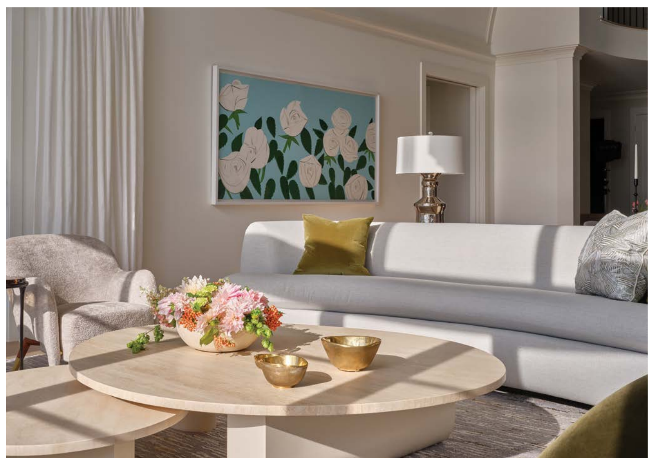
Highlighting the homeowner's extensive art collection, including the Alex Katz artwork titled "White Roses", are Isla coffee tables and a curved sofa from Dmitriy & Co in neutral tones.