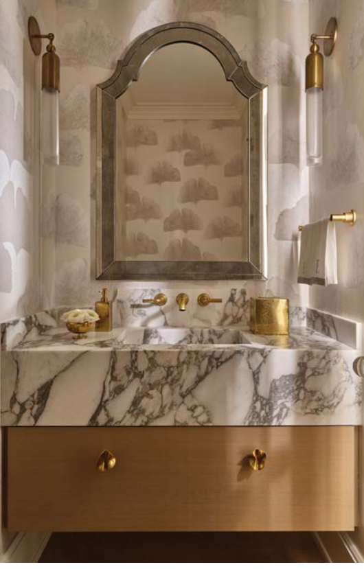
ABOVE LEFT The primary suite beckons with the promise of a comfy king bed and lounge chair easily pulled up before the rebuilt fireplace and surround. ABOVE RIGHT Guests are greeted with a stellar jewel box powder room whose dreamy aspects include a Calacatta Viola marble sink by Lambert Stoneworks, with ceruse finish cabinet by O.B. Williams and Morgans Fine Finishes.

48 PortraitMagazine.com PortraitMagazine.com 49