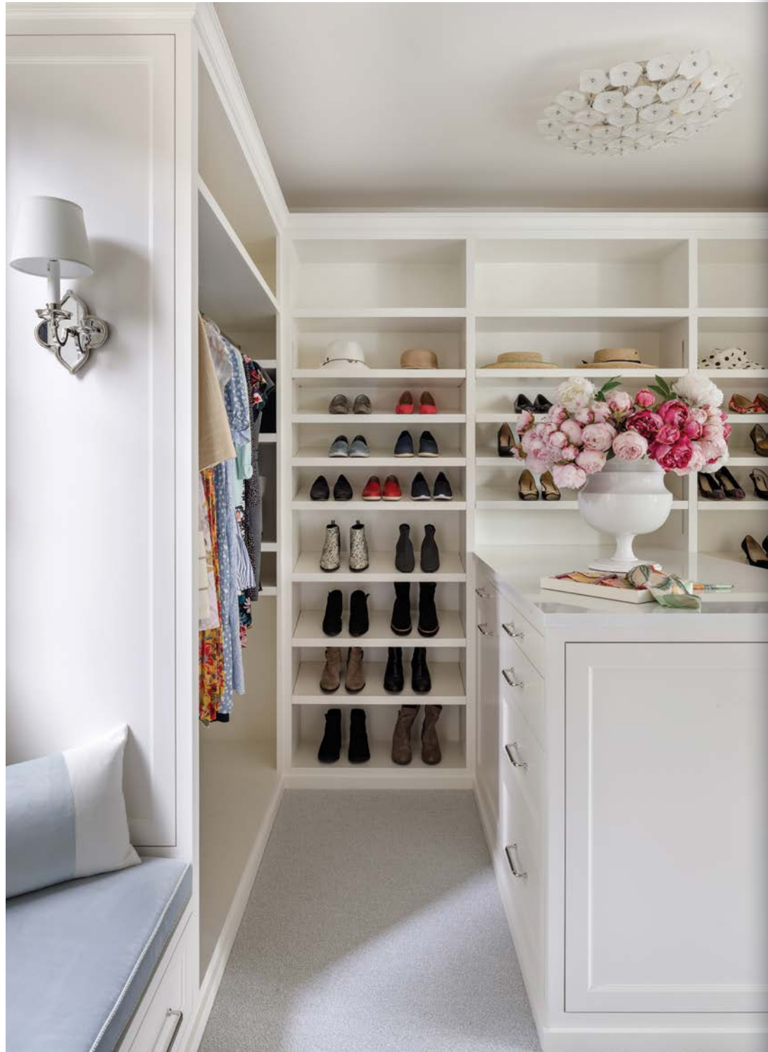
The dressing room features custom cabinetry by Warmington & North that include tray inserts for jewelry, a Rainier Quartz counter and Stark Carpets floor covering. The cozy window seat was reupholstered in Pindler fabric by La Fabrique.

CONTRACTOR Schultz Miller schultzmill.com