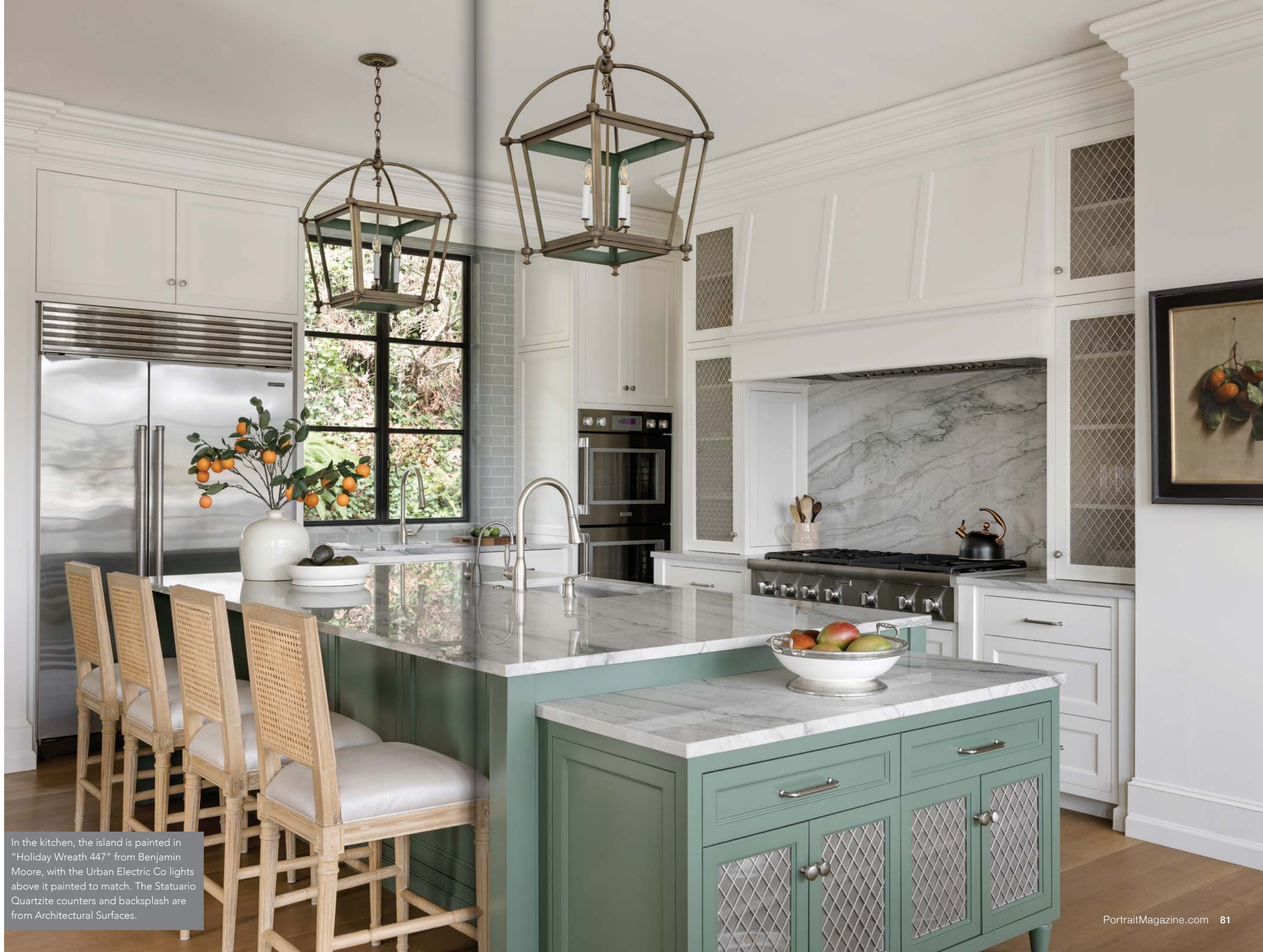
In the kitchen, the island is painted in “Holiday Wreath 447” from Benjamin Moore, with the Urban Electric Co lights above it painted to match. The Statuario Quartzite counters and backsplash are from Architectural Surfaces.

A second sink is tucked beneath the windows, flanked by the columns of the refrigerator and wall ovens, the latter which have doors with side hinges, so as to be accessible in a pass-through. A six-burner cooktop is