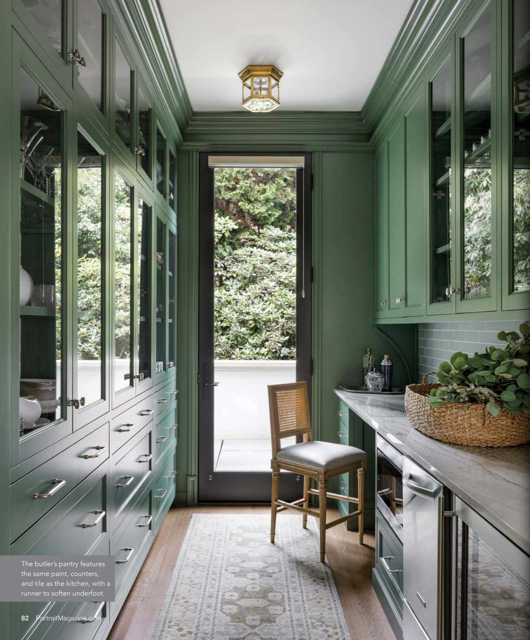
The butler's pantry features the same paint, counters, and tile as the kitchen, with a runner to soften underfoot.