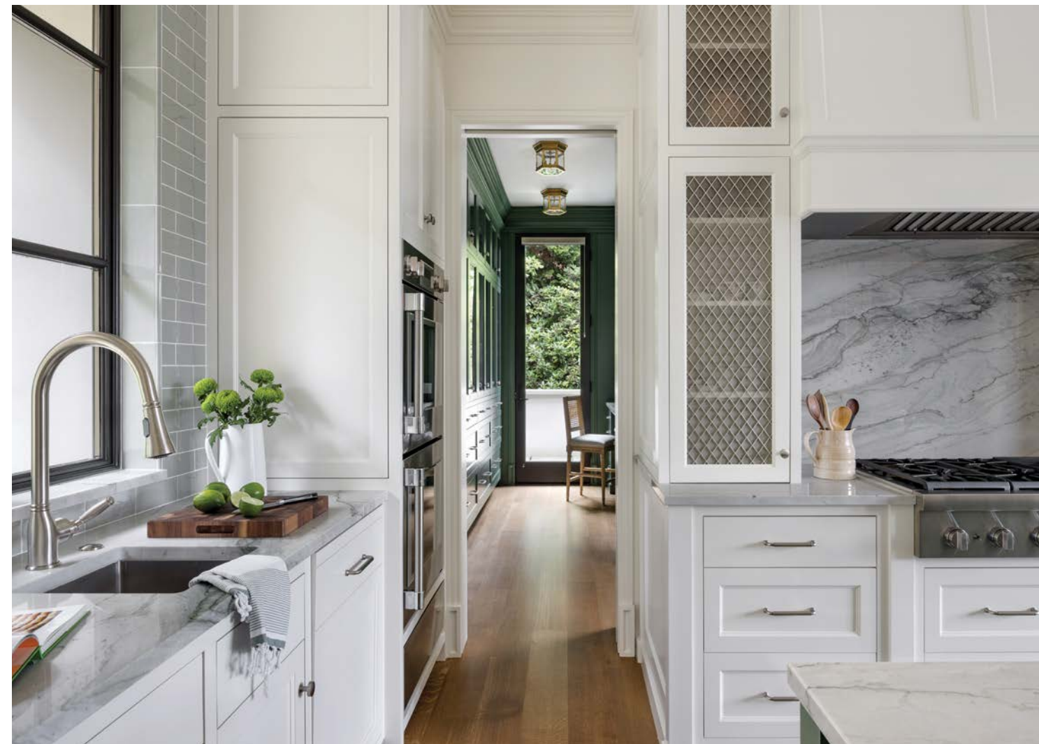
The cabinets feature small diamond grille in polished nickel from Katonah Architectural Hardware, while the walls have Country Equipe "Mist Green Gloss" tile from United Tile.

I also wanted to enhance the design in such a way that it was beautiful and elegant.