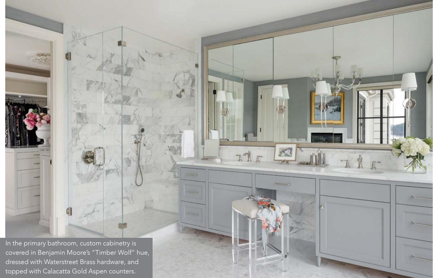
In the primary bathroom, custom cabinetry is covered in Benjamin Moore's "Timber Wolf" hue, dressed with Waterstreet Brass hardware, and topped with Calacatta Gold Aspen counters.